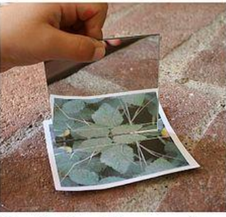
Exploring Symmetry in Nature